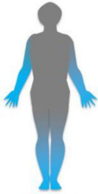
Sensory deficits are drawn in blue